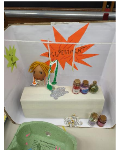
Y3 third place – Aurelia 3KS Garnet Earth