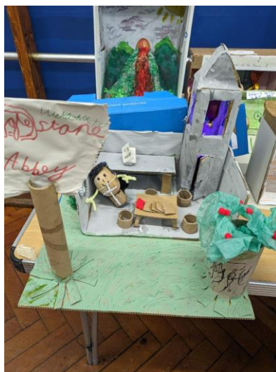
Y4 second place – Matthew 4M Topaz Water