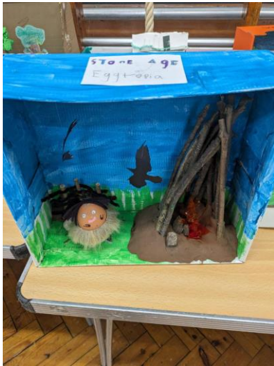
Y3 first place – Ivy 3RS Sapphire Air

Thank you to our Hamleteers for getting involved.