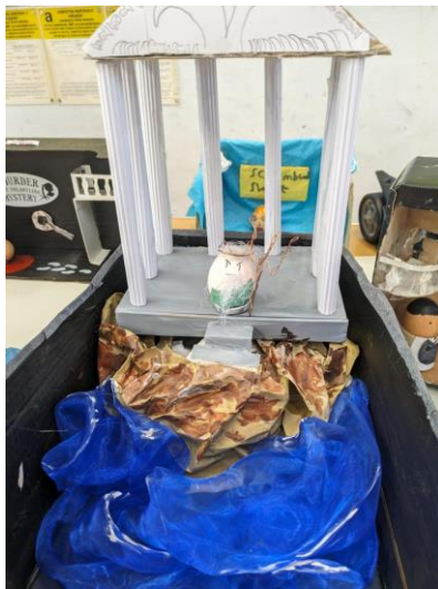
Y5 second place – Bohan 5N Topaz Water