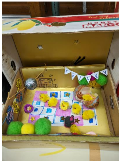
Y3 second place – Tria 3RS Topaz Water