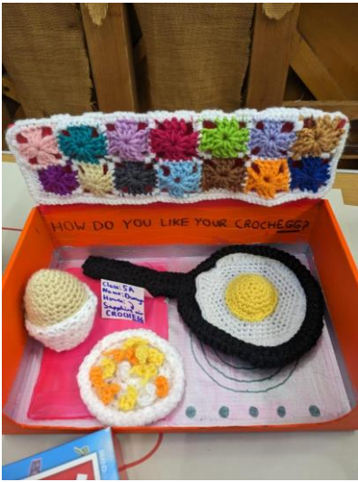
Y5 first place – Dunya 5A Sapphire Air