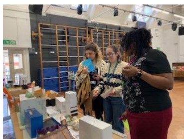
The judges in action!

Best wishes to you all for a happy Easter!