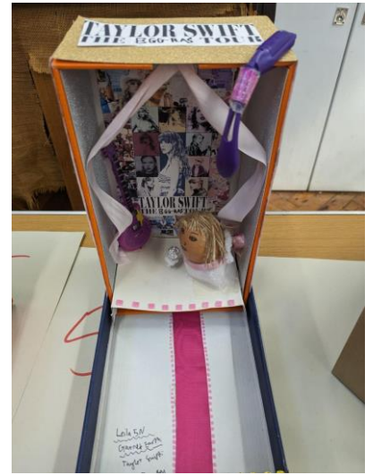
Y5 third place – Leila 5N Garnet Earth