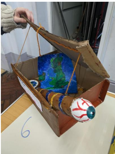
Y6 second place – Willow 6W Garnet Earth