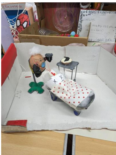
Y4 first place – Saafia 4G Garnet Earth