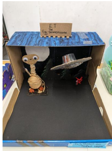
Y6 third place – Ivy 6O Topaz Water