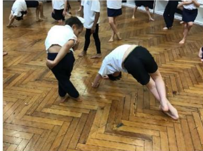
Exploring all three levels and body shapes.