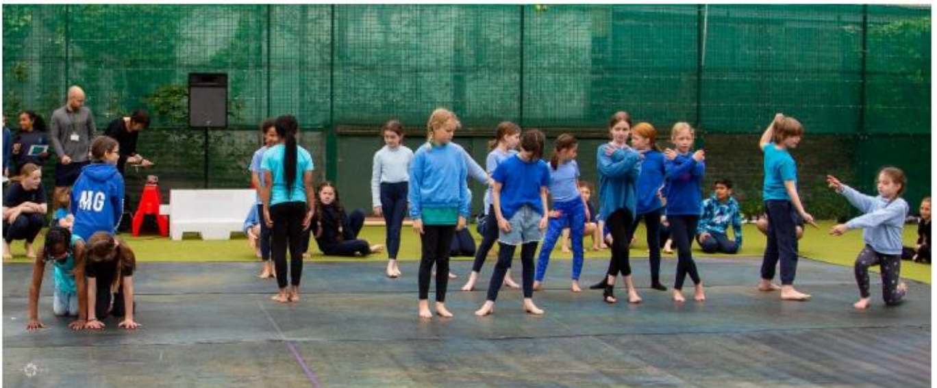
Year 5 looked at Sheweshwe fabric from South Africa, and created motifs from the repeated patterns

Dance is about expressing a thought, feeling or idea, and the teaching of dance should focus on these three key concepts. Children at the Hamlet are encouraged to develop their ideas through structured, yet flexible lessons, linked to the wider curriculum and where they develop a vocabulary of movement. I have found that teaching a particular style or genre of dance can be restrictive to the children. Whilst there are very strong arguments for the teaching, study and appreciation of popular and cultural dance styles, focussing too much on any of these, particularly at primary level, can be divisive and comes with a risk of alienating most of the class. Children feel as though they “can’t do it” or that they “don’t want to do it”. These issues often arise when children are taught routines in popular dance styles.